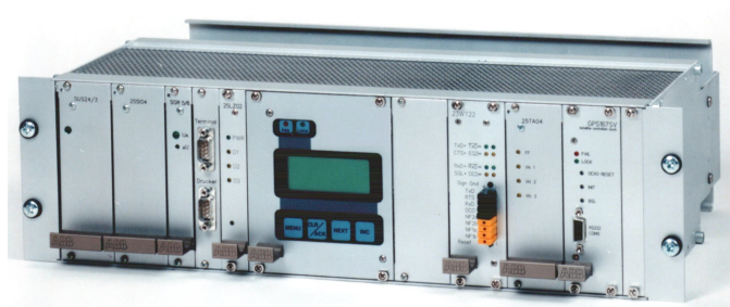
Local Control Unit LMC610